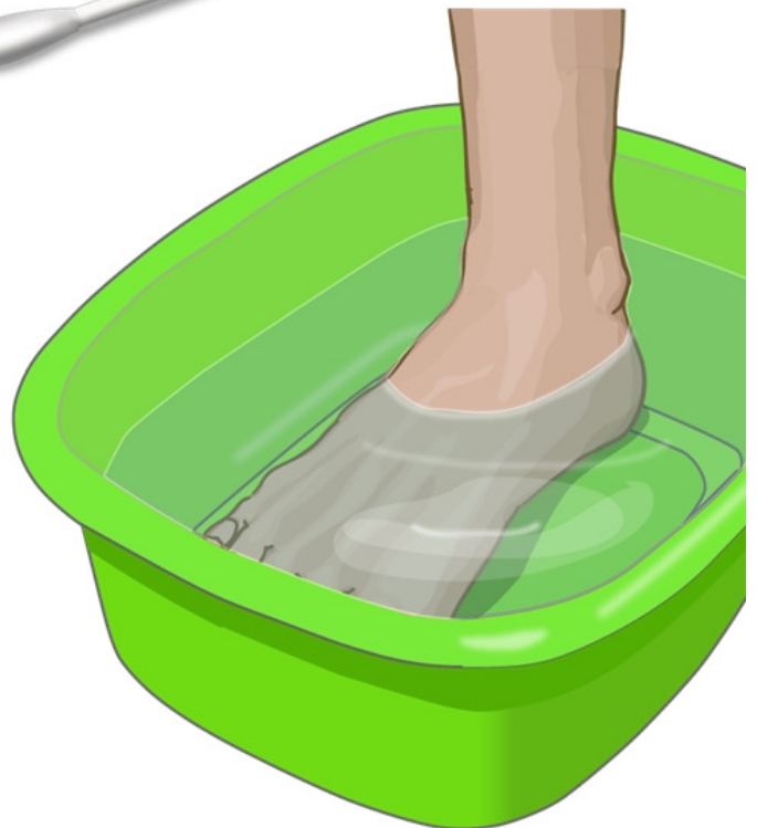
Bowl to wash your feet